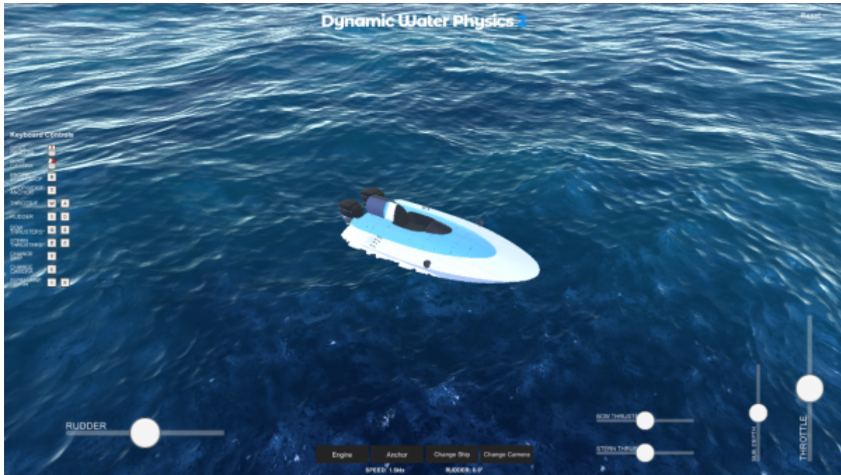
Screenshot of desktop demo for DWP2 with Crest.