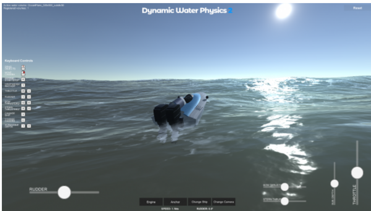
Screenshot of desktop demo for DWP2 with Lux Water.

Lux Water is 3rd party ocean renderer and requires separate download from here